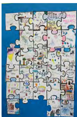
The network of amazing students in Year 1/2