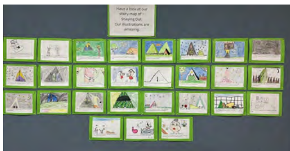
Entertaining Story Maps in Year 3/4